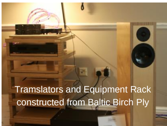
Translators and Equipment Rack constructed from Baltic Birch Ply

When it comes to getting the best from high-end audio components it is important not to treat cables as just accessories. That understanding is central to Wire On Wire's ethos and we were able to demonstrate its importance at this year's North-West Audio Show at Cranage Hall. Wire On Wire and 3SquareAudio presented at the show jointly with our Experience680 tuneable interconnects and Experience660s speaker cables and their Translator floor-standers and stand-mounted Liberators all driven by carefully tuned first-order crossovers .