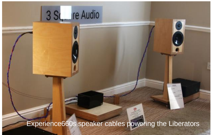
Experience660s speaker cables powering the Liberators

We pitched this against another cable tuned (2,3,4, 8 and 13 tuned) to soften the upper frequency presentation (without loss of detail) to enhance the mid-range slightly as a way of showing our visitors how the system could be adapted to a particular system and user. Visitors had clear opinions, some preferred this latter version whilst others preferred the cable tuned to give a little more lift to the upper frequencies. The age of the listening ear of course plays a part in these observations.