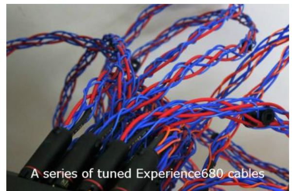
A series of tuned Experience680 cables

The first day we had on show the Translators connected to our NVA A-30 MkII amp with the Experience660s speaker cables. An NVA passive amp connected our switching-unit to our Oppo CD player. We wanted to get the sound right for the room and bring out the best in the speakers so we tuned the Experience680 for that. We found that opening up loops 3, 8, and 15 to tune the Experience680 did the job. The system without tuning had sounded a little bright for the room. But we also wanted to demonstrate to our visitors that the cable could sound softer so we tuned another with loops 3, 8 and 13. Playing a variety of music we could switch between the cables allowing our visitors to hear the difference that geometry changes can make. The uplift between the softer presentation and the tuning we had chosen for the show was easily noted by virtually all our visitors including an astonished Stuart from HifiPig (a noted sceptic when it comes to cables).